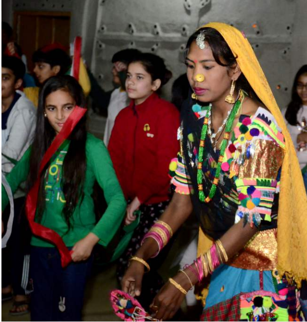
TAGORE INTERNATIONAL SCHOOL VASANT VIHAR, NEW DELHI