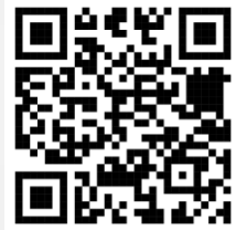
DEEPTI CAMP LEADER

Scan to know more about our camp and Dudhwa