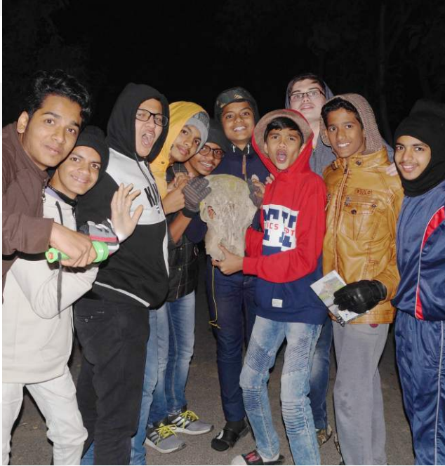
ANUBHUTI RESIDENTIAL SCHOOL JALGAON, MAHARASHTRA